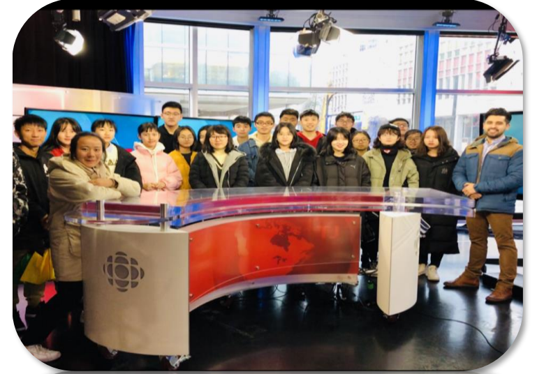
Visit the Canadian TV station to learn the operating mechanism of foreign media industry