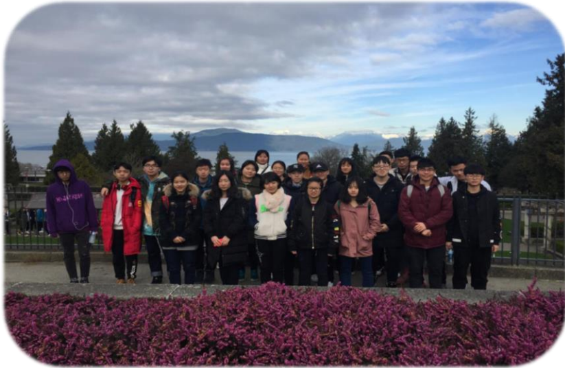
Winter Camp - Photo of visiting University of British Columbia