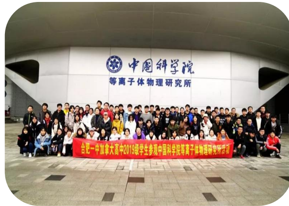
Feel the charm of science at close range, and organize activities to visit Science Island